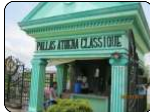
Pallas Athena Subdivision*

ITEM PB152 - Lot Only Title ID : 1538 Lot Area: 925.00 sqm. TCT # T-534966 Lot 15, Blk 6 Min. Bid Price : 925,000.00