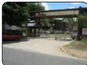
Rodeo Countryside Estate,, Brgy. Esperanza,, Alfonso, Cavite

ITEM A146 - Vacant Lot Title ID : 18886 Lot Area: 7,343.00 sqm. TCT # T-1322082 Block 134 Lot 1 Min. Bid Price : 24,000,000.00